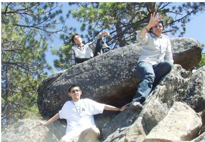
"Lord, plant my feet on higher ground." 我們喜歡爬到最高之處.