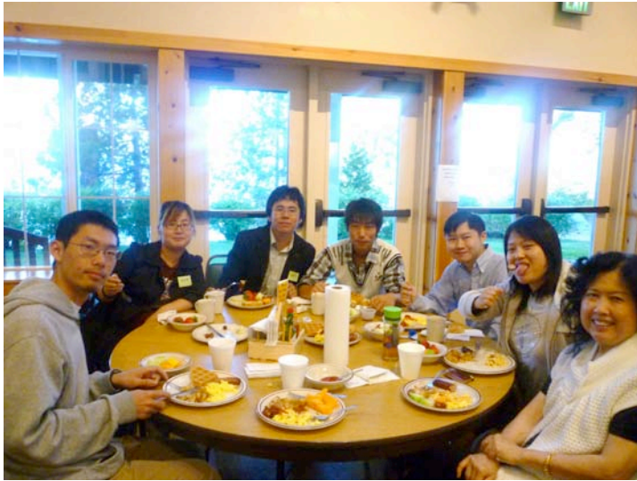
Wow, the breakfast is wonderful!! 每天享用豐富美餐.