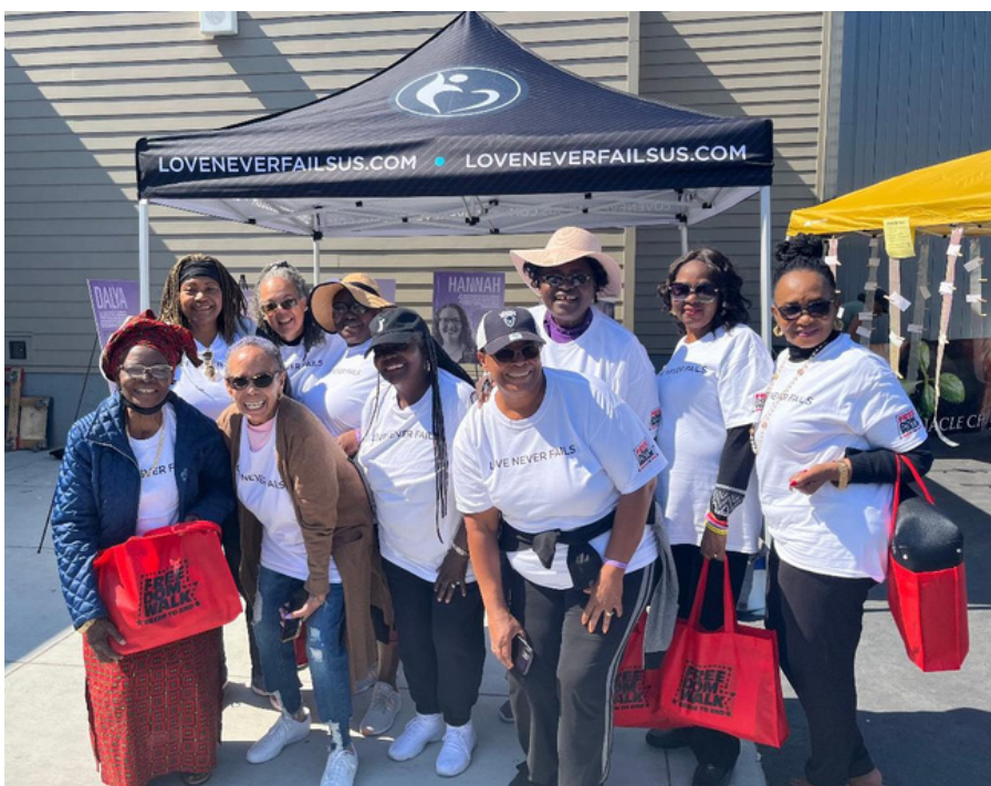
PW in their Love Never Fails shirts at the Freedom Walk