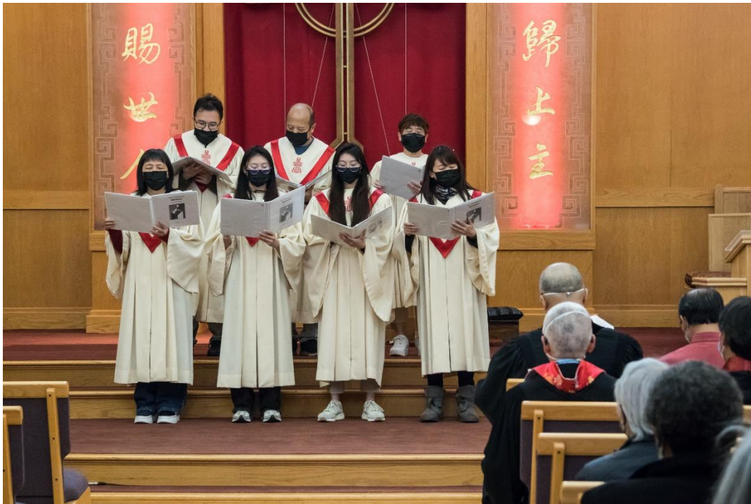
Anthem: Glory to God in the Highest, The Cantonese Worshipping Community Choir