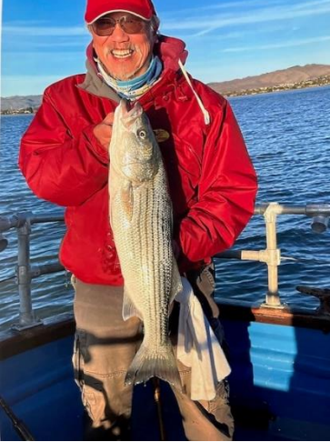
Striped bass, 7 pounds