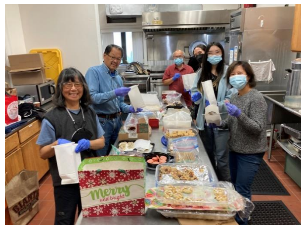
Cookie packing elves