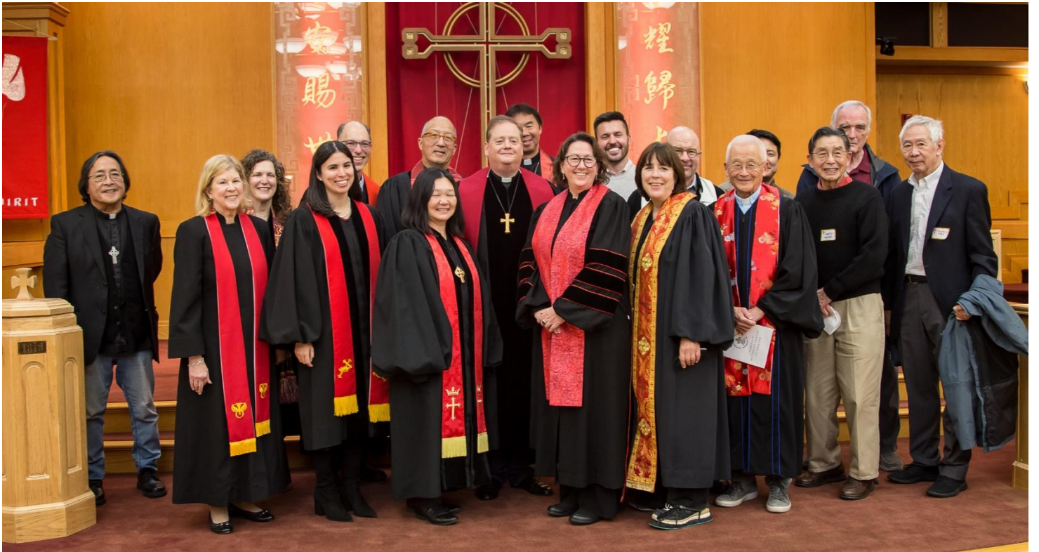
Administrative Commission Members and Ministers