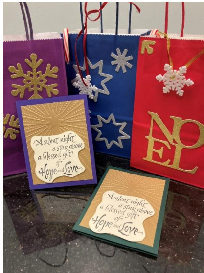
Cookie bags and cards