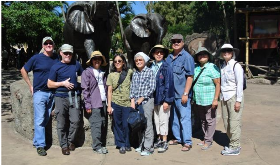
The 2015 PCC Team in Guatemala

Or make a donation of any amount that God leads you to give in honor of all of our mothers. Above all pray for the people who will have clean water through the ministry of Living Water World Missions ... thanks to your donation.