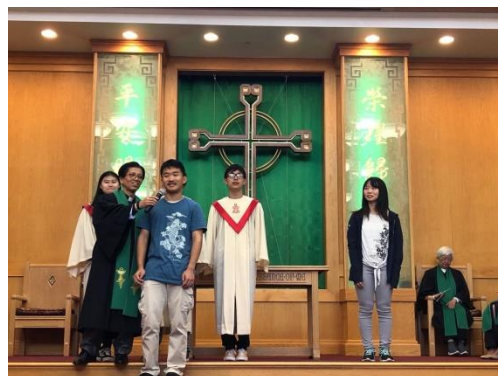
8/11/19 Special worship for college students

Plenty of wonderful events have happened during this year, thanks to our Lord. We will continue to pray to Him, anticipating what He has in store for us in the future.