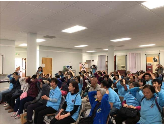
8/3/19 Annual Evangelism event "Jesus Loves Chinatown"

At the beginning of August, we participated in the annual outreach program called "Jesus Loves Chinatown". This is a day where all the churches in Chinatown join together to reach out to the Chinatown community. On that day, we passed out flyers on the streets and invited people to come to our church. Afterwards, we held a special worship to pray for all the students who would start their new school semester in the coming months.