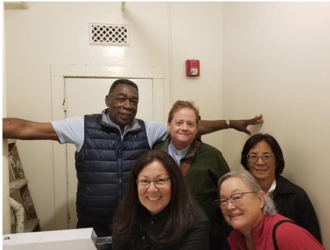
Rev. Arlington Trotman with outstretched arms was able to touch opposite walls in one of the residential single rooms at the Clayton Hotel.

International peacemaker, Rev. Arlington Trotman, an immigrant to the United Kingdom and a leader in the struggle for racial justice in England and Europe, visited the Bay Area from September 23-October 2, 2019.