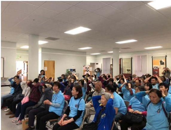
8/3/19 Annual Evangelism event "Jesus Loves Chinatown"

At the beginning of August, we participated in the annual outreach program called "Jesus Loves Chinatown". This is a day where all the churches in Chinatown join together to reach out to the Chinatown community. On that day, we passed out flyers on the streets and invited people to come to our church. Afterwards, we held a special worship to pray for all the students who would start their new school semester in the coming months.