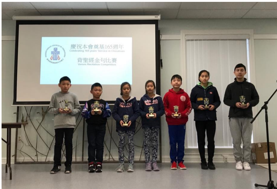
Verses Recitation – Sunday School & Youth

Thanks to our gracious Lord, 2019 has been a good year for the Cantonese Commission so far. We are excited to see what God has in store for us next in the near future.