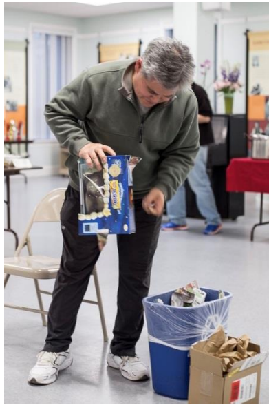
It's the turtle!