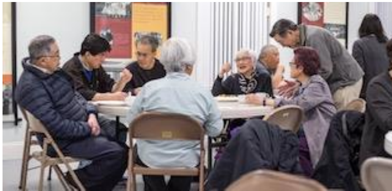
Friends and fellowship!