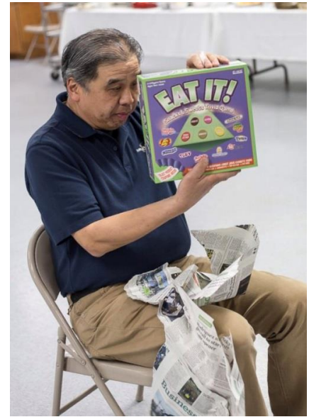
Perfect gift – "Eat it!"