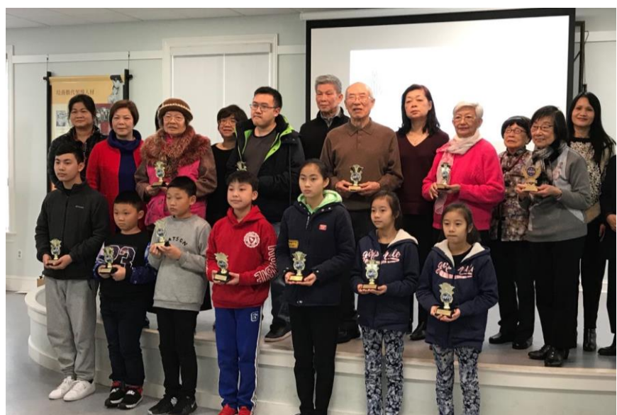
Verses Recitation Award Presentation